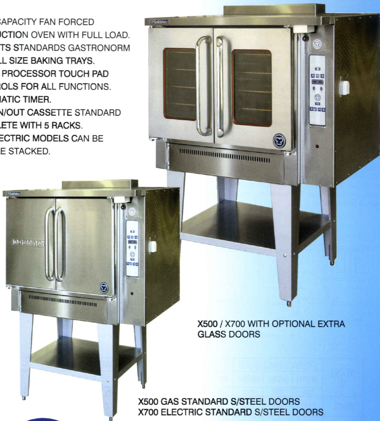
X500 / X700 WITH OPTIONAL EXTRA GLASS DOORS