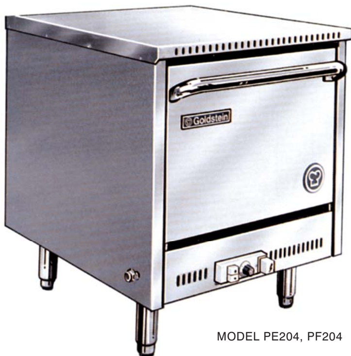
MODEL PE204, PF204