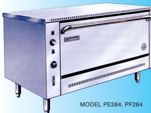
MODEL PE284, PF284