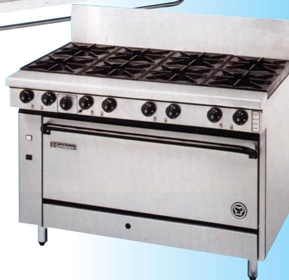
Static Oven - Gas PF-8-40