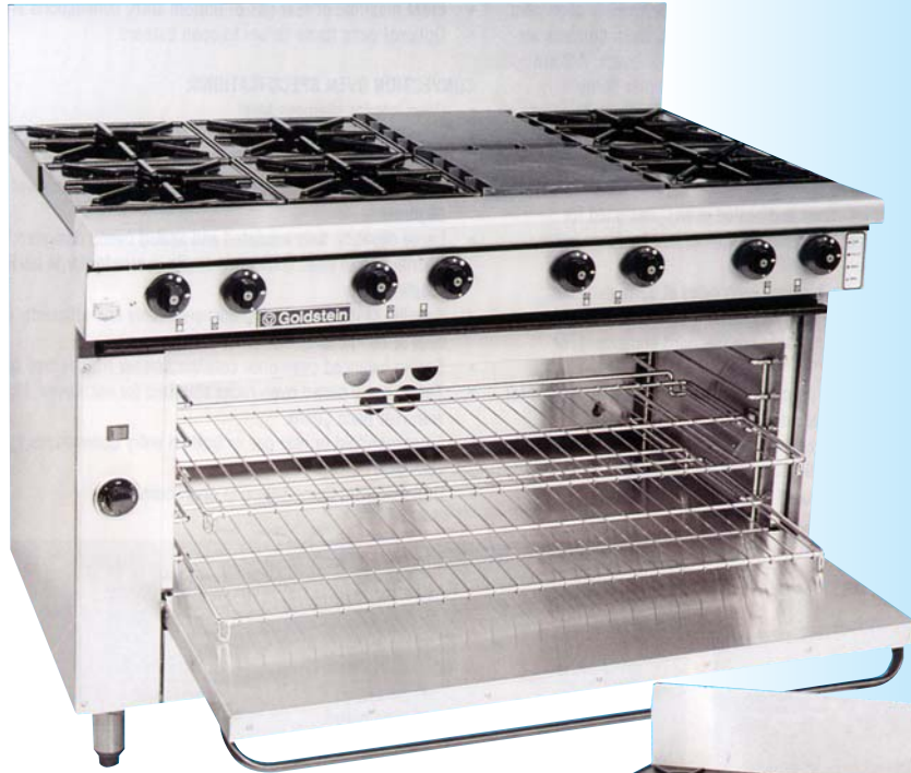
Fan Forced Convection oven Electric PFC-8-40E