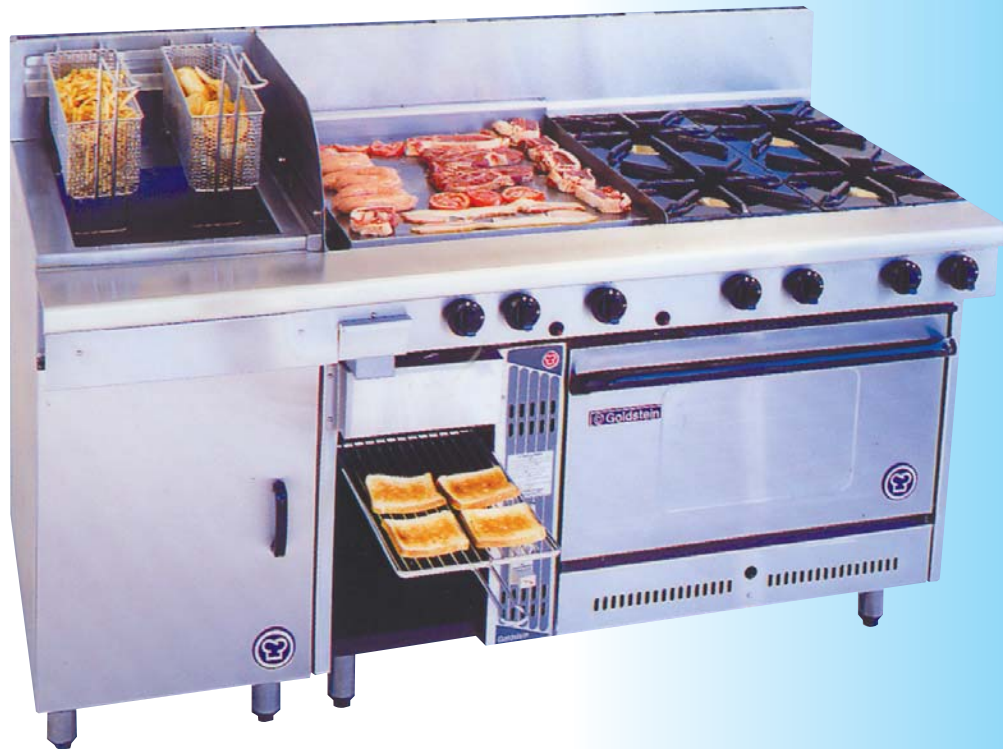
Model PF-24G-4-28/SA/FRGI Multi-1