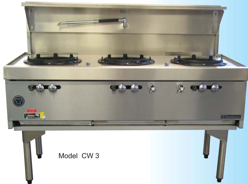
Model CW 3