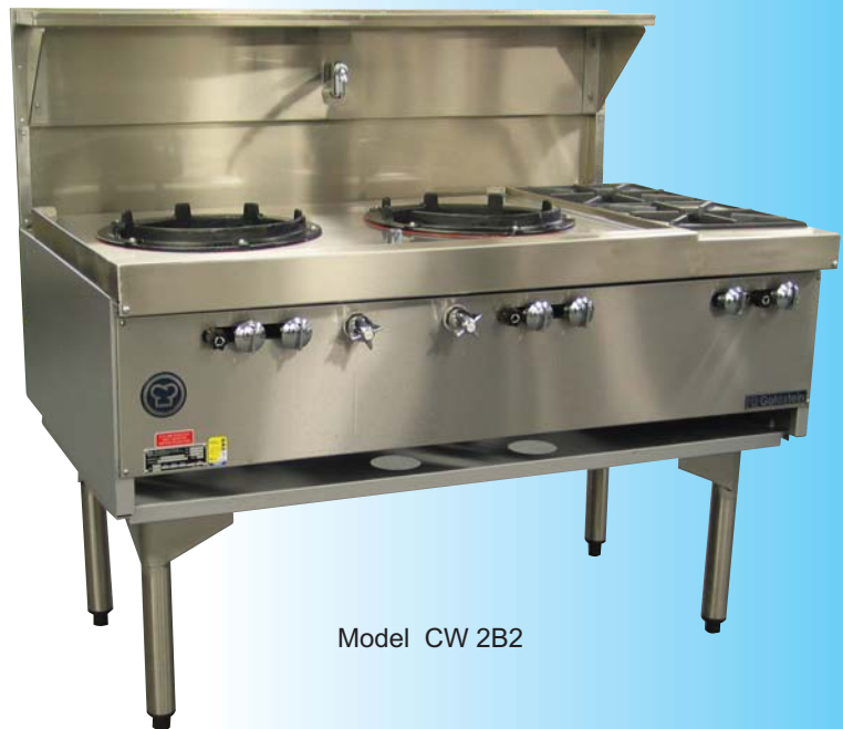
Model CW 2B2